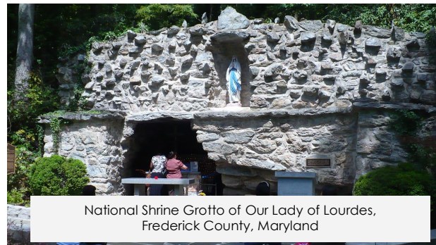
National Shrine Grotto of Our Lady of Lourdes, Frederick County, Maryland

Not Included: Airline luggage fees, Lunches and Beverages, Tips to your guide & driver.